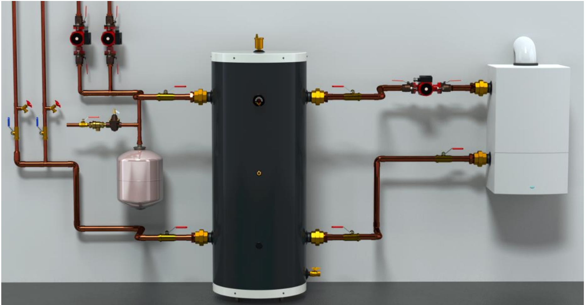
Figure 1: BUFFMAX Typical Installation