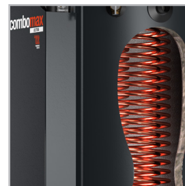
Combomax Instant hot water delivered through a dedicated copper line.