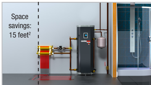
Combomax Floor and wall space savings.