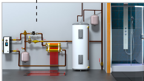
Conventional water heater and BthUltra boiler.