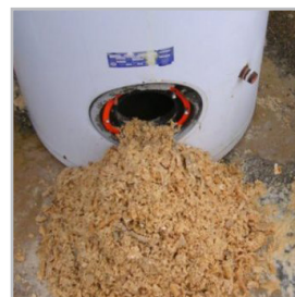
Conventional water heater Prone to sediment buildup and bacterial contamination.