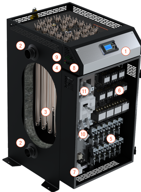
VoltMax 408 kW – 600 V with main disconnect switch option